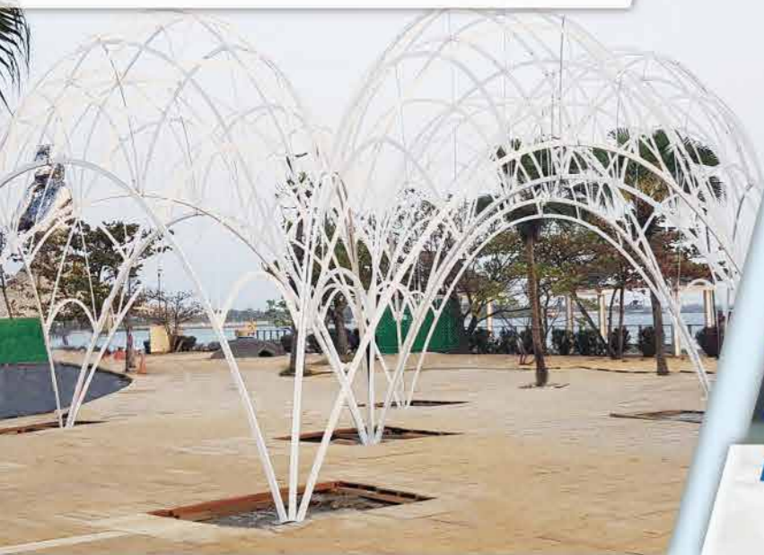
2019 台灣燈會裝置藝術 珊瑚之心 支架 2019 Taiwan Lantern Festival Installation Art Festival. Coral Heart (Structure of Coral Heart)