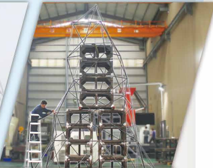
2019 新北歡樂耶誕城 聖誕樹裝置藝術 支架 2019 New Taipei Happy Christmas City. Christmas Tree Installation Art Structure