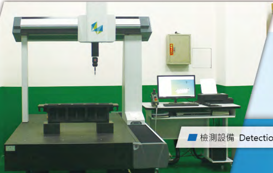
■ 檢測設備 Detection Equipment